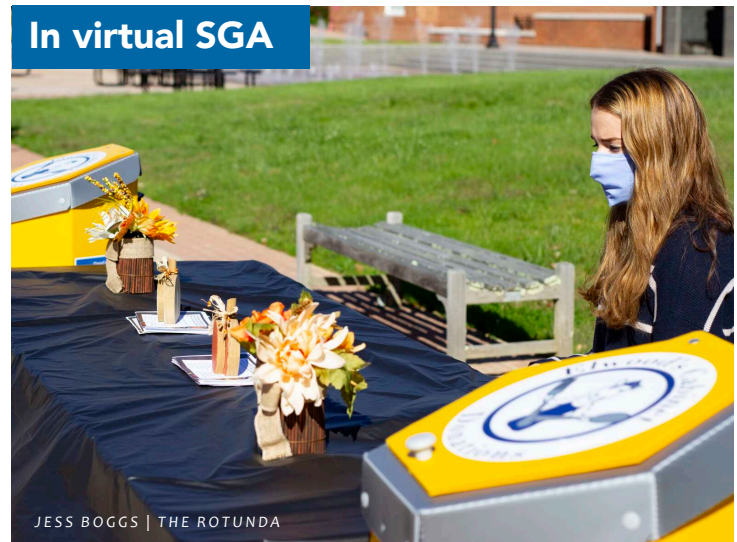
Elwood's Cabinet tables along Brock Commons on November 3, 2020 to accept donations.