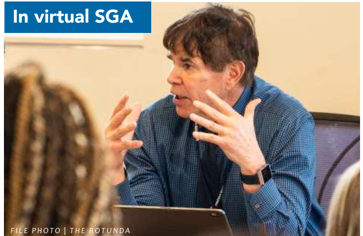
FILE PHOTO | THE ROTUNDA