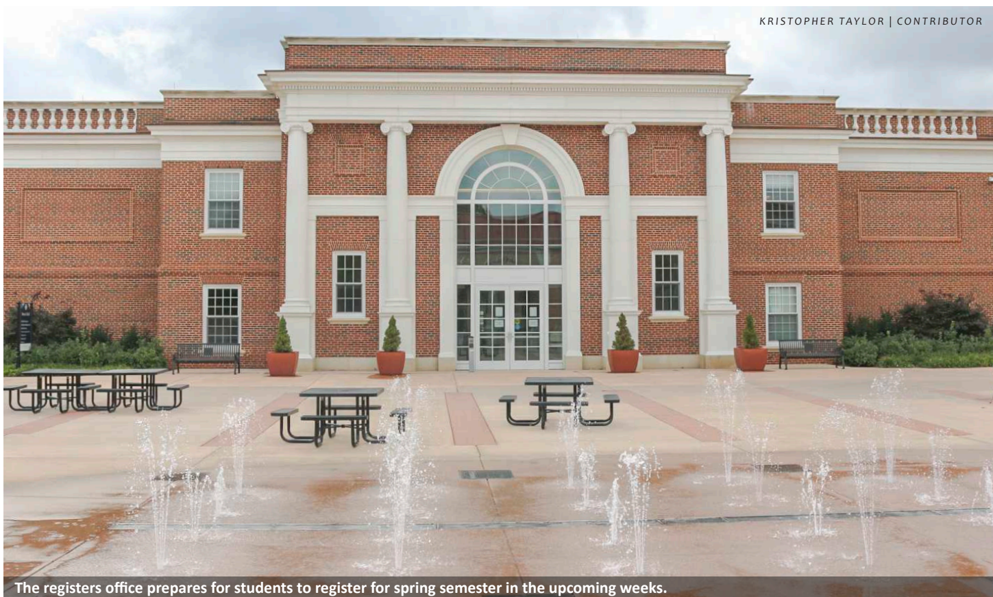
The registers office prepares for students to register for spring semester in the upcoming weeks.