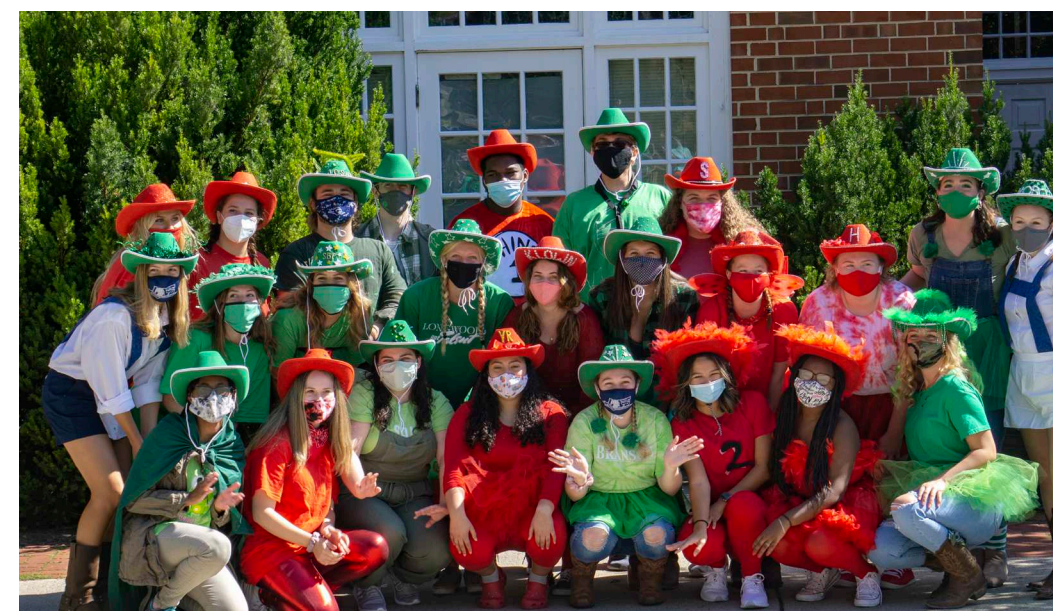
The Klowns are students that are recognized by their peers as leaders on campus who continue to show the spirit of Longwood and make their peers' time at Longwood more enjoyable. The Klowns are a mixture of students from all four graduating classes.