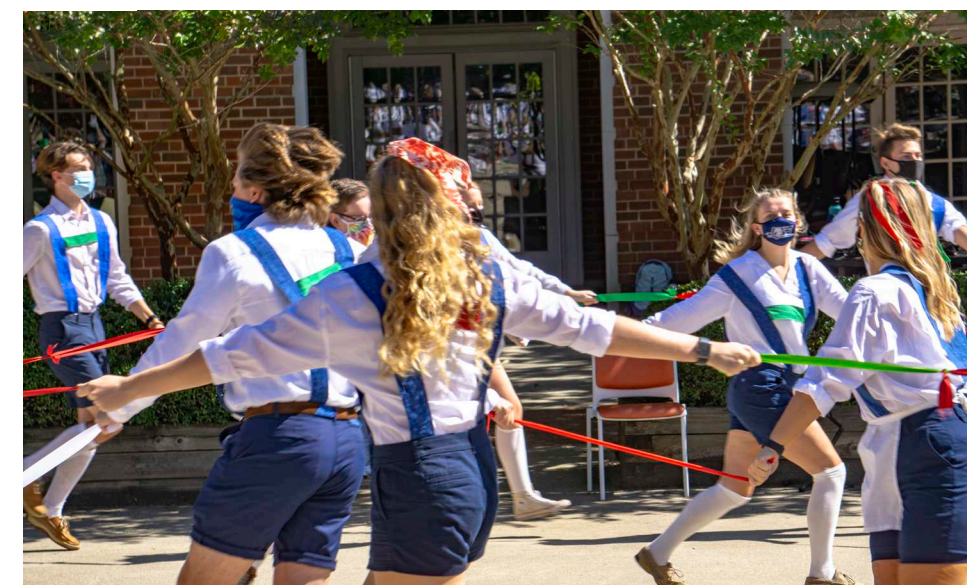
During the Oktoberfest celebration this past Saturday, Longwood Mortar Board Senior Honors Society recognized the student spirit leaders on campus. These students are nominated by their peers as outstanding leaders on campus. Wearing the recognizable lederhosen, the Spirit Leaders performed a dance for the Longwood community.