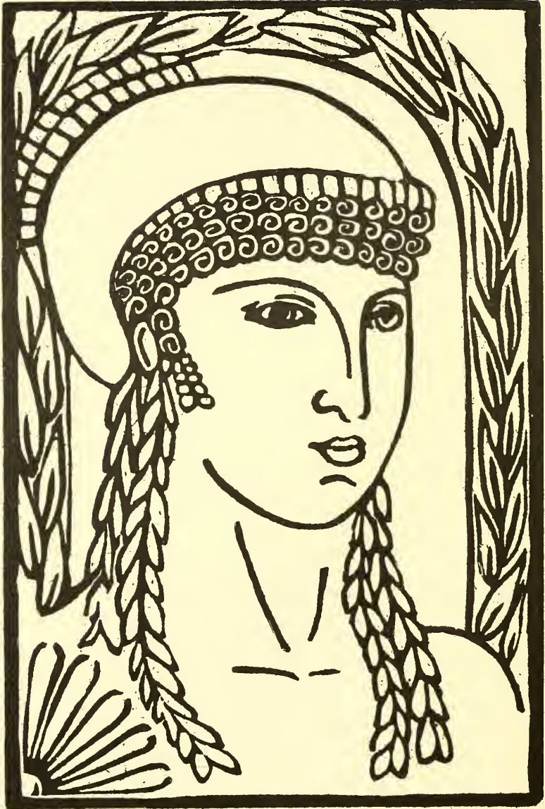
ARCHITECT OF THE PAST