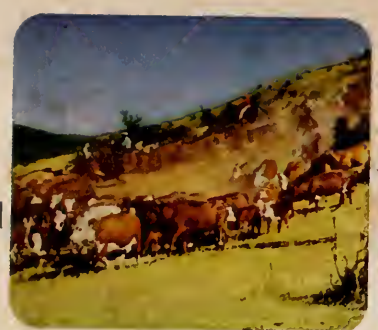
Driving cattle! Desert sun ablaze!

Live-action shots-Saddle Mountains, Wash.