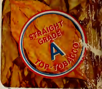
Top-tobacco, straight Grac's-A Top-tobacco all the way!