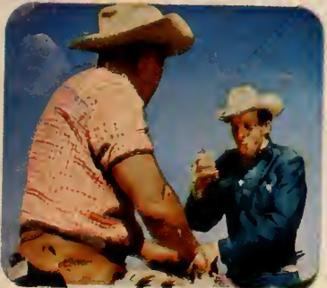
Herding steers across the range you'll find a man