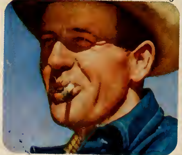
That you're smokin' smoother and you're smokin' clean!