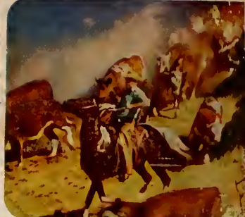
Pounding leather rounding up the strays!