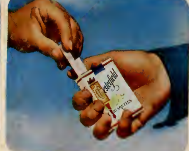
Takes big pleasure when and where he can...Chesterfield King!