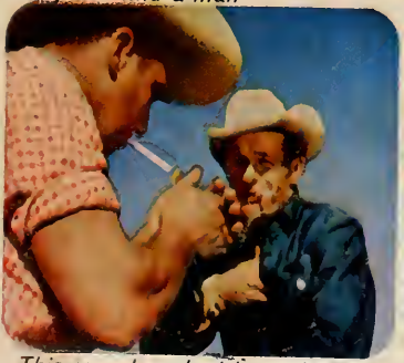
This sun-drenched top-tobacco's gonna mean...