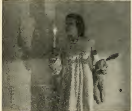
"I'm still the same sweet, simple girl."

famous. She was wanted by every studio in Hollywood. With her new upper plate, she was immediately classed as a fresh Hollywood discovery. But the spotlight did not alter her ambition or go to her head. She took it all in her stride. As she has always said, "Success will never turn the head of one who really deserves it."