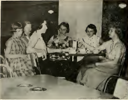
Tired extras from the extravaganza, "Paradise Lost" relax at the commissary between takes.