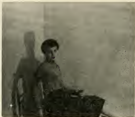
"I was bored. Nauseatingly bored."