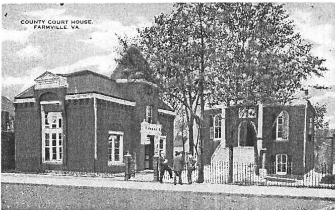
Prince Edward County Clerk's Office and Courthouse – 1915