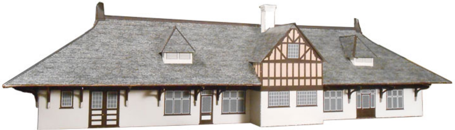
Farmville Train Station Kits – 17” x 6”, 3 dimensional - $15.00 (assembly required)