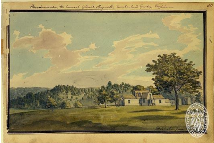
Hors du Monde – by Benjamin Henry Latrobe, 1796

The Appomattox River is a tributary of the James River, approximately 157 miles long, in central and eastern Virginia, named for the Appomattocs Indian tribe who lived along its lower banks in the 17th century. The Appomattox River rises in the Piedmont of northeastern Appomattox County, approximately 10 miles northeast of the town of Appomattox. It flows generally southeast through the Appomattox-Buckingham State Forest to Farmville. From Farmville it flows in a large arc northeast then southeast across the coastal plain, passing southwest of Richmond and passing through the Lake Chesdin reservoir. It flows through Petersburg, its head of navigation, through the Tri-cities area, then joins the James River from the west at City Point in Hopewell.