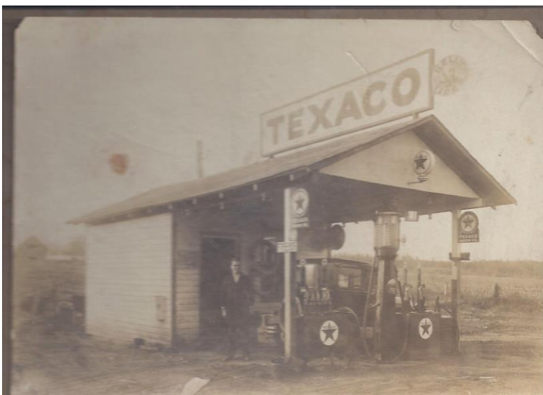
Texaco Station – Kingsville – 1925/26