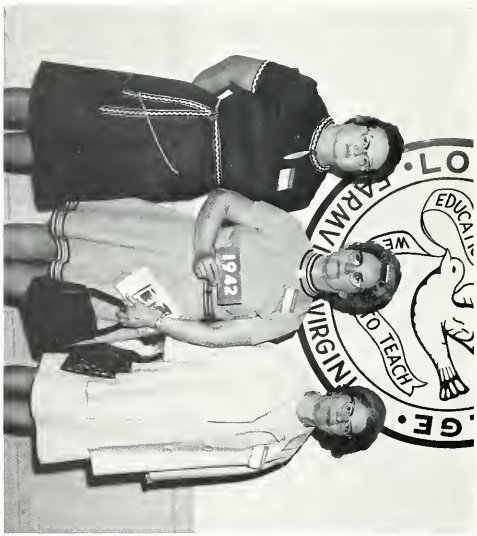
Class of 1942