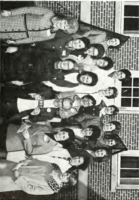
Class of 1957