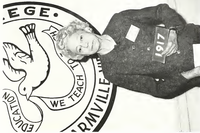
Class of 1917