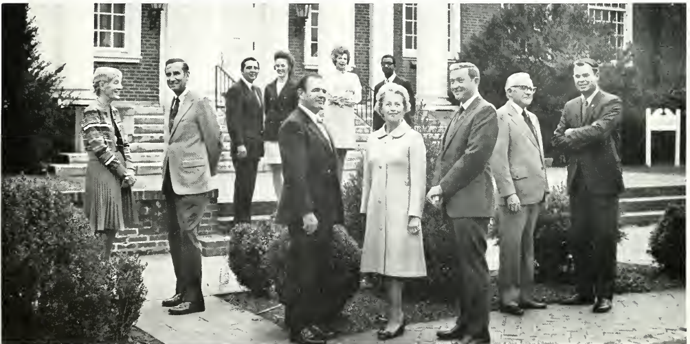
Longwood's Board of Visitors: