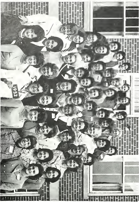
Class of 1952