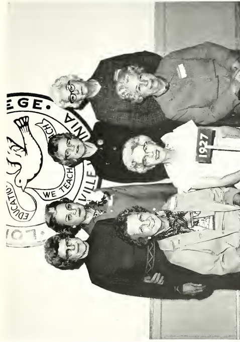
Class of 1927