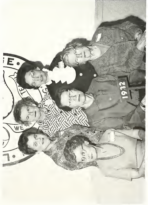
Class of 1932