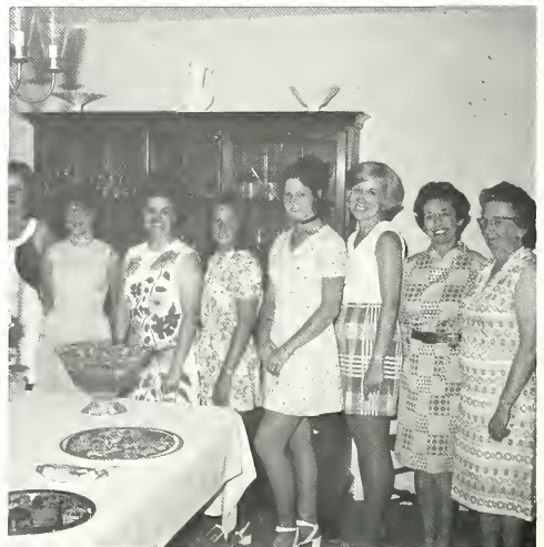
The Appomattox Alumnae Chapter entertained at a party for students and alumnae.