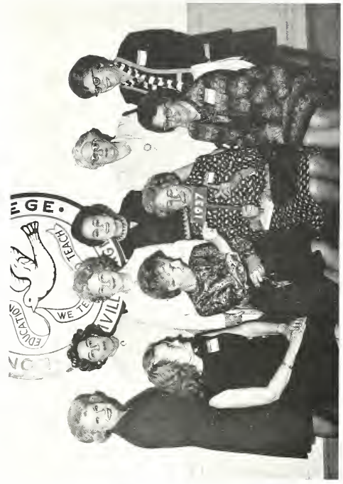
Class of 1937