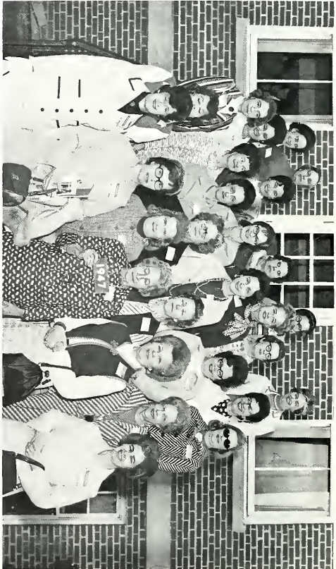
Class of 1947