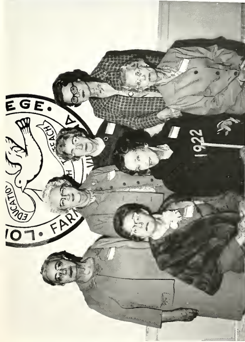
Class of 1922