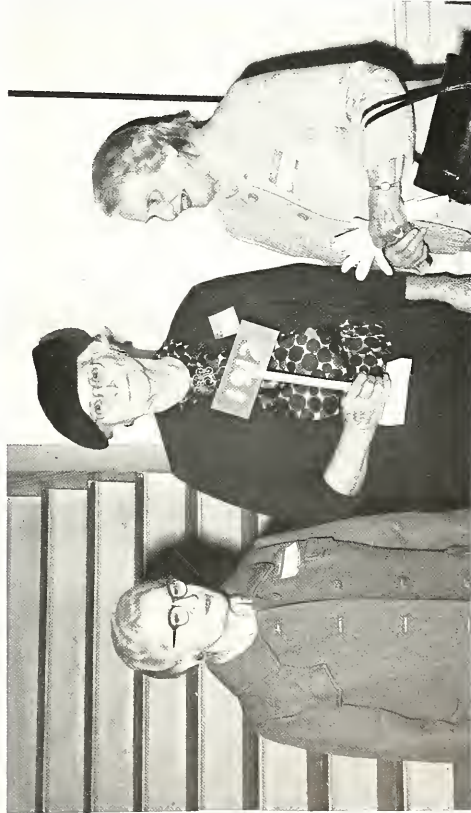
Class of 1912