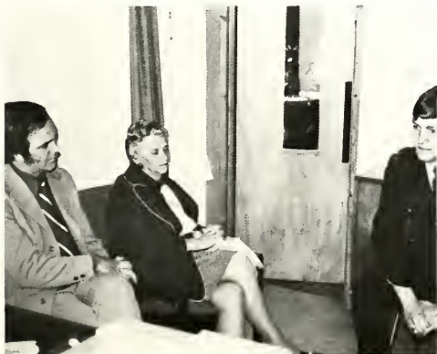
Scenes taken during visit to English Schools.

Despite all the obvious disparities between their educational philosophy and the realities of their educational system, we were impressed by their definite commitment to an educational philosophy. It takes time to change an educational system and time to educate a society toward this change. We left England as convinced as ever that the open classroom philosophy is the best method of educating a people for a democracy.