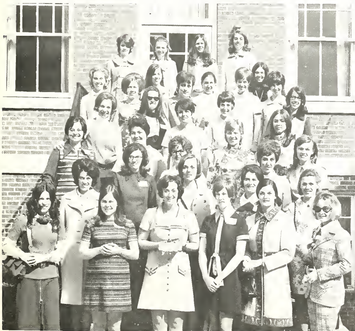
Class of 1967