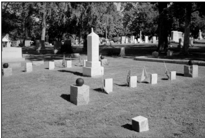
Westview Cemetery Confederate Square