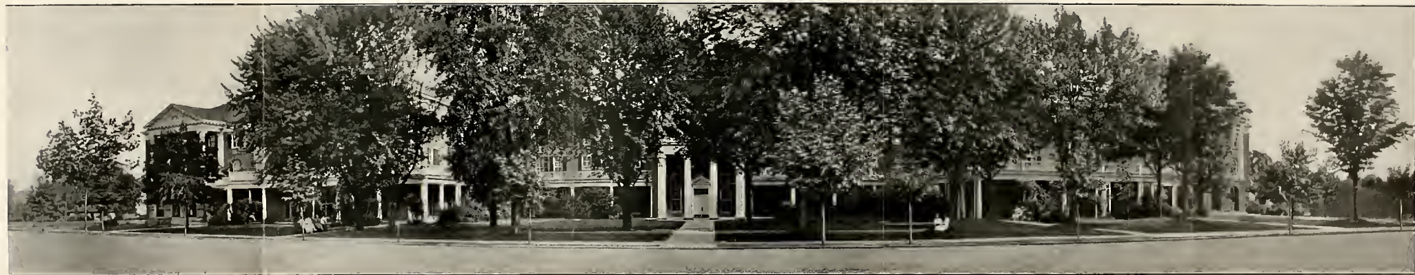
STATE TEACHERS COLLEGE—FARMVILLE, VIRGINIA