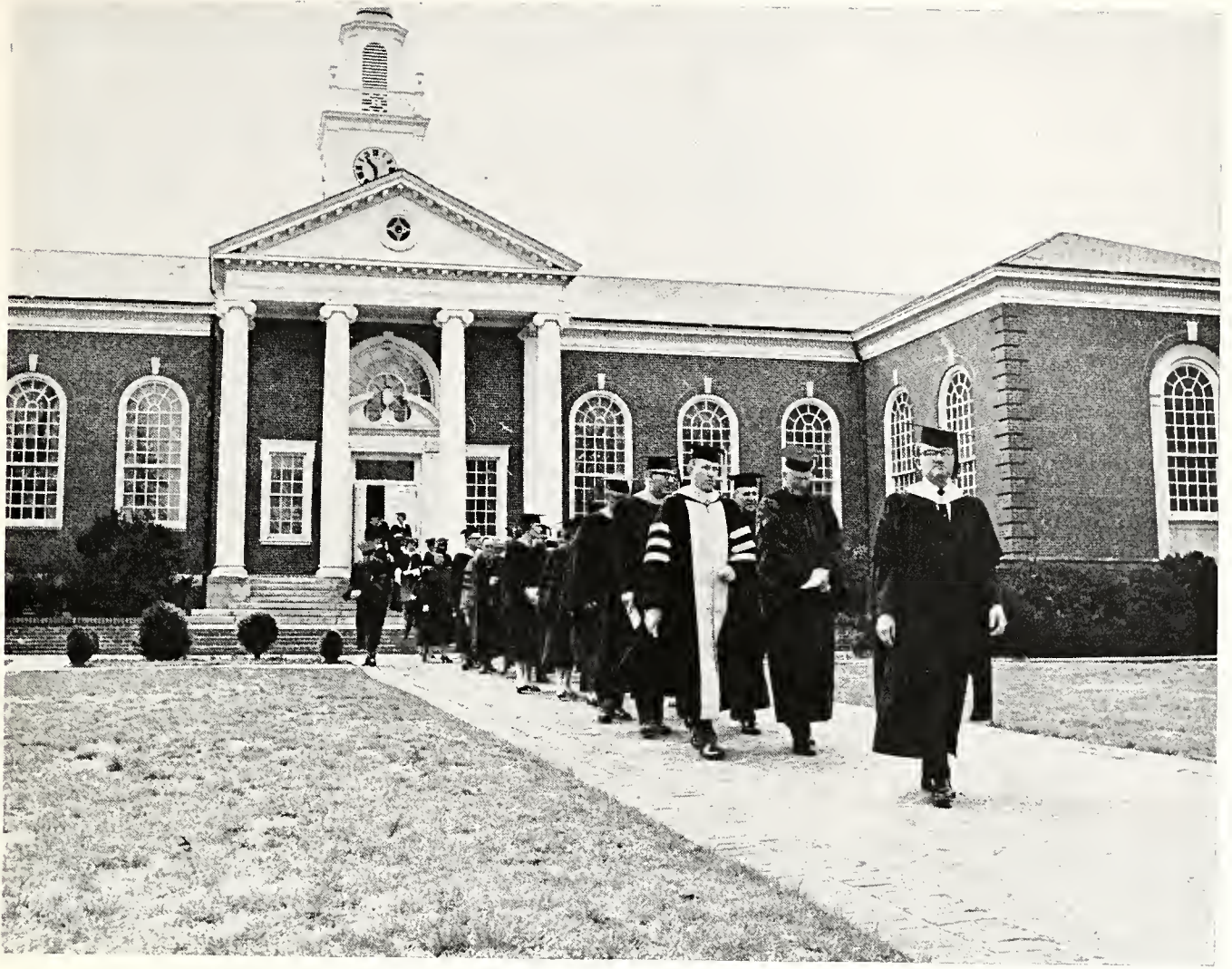
Academic procession leaves Lancaster Library for Jarman Hall.