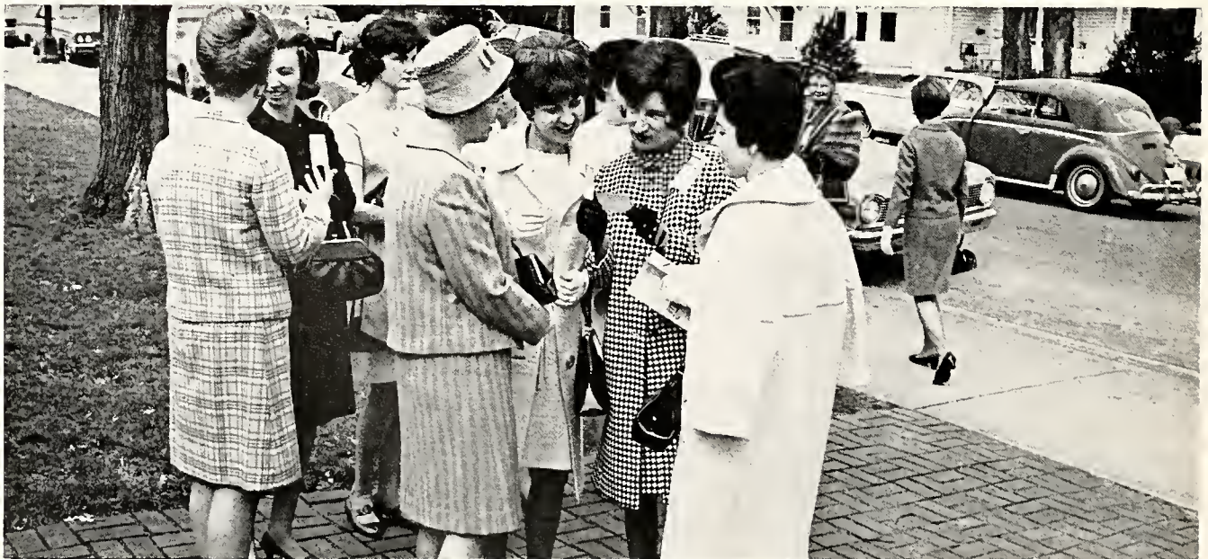
Alumnae enjoy reminiscing in front of the Alumnae House.