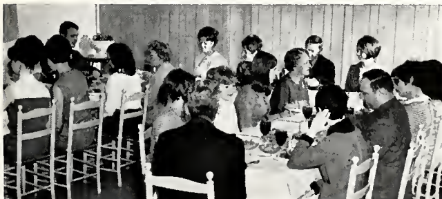
Faculty, staff and student government leaders get together for monthly luncheons as one means of effective communication. Students take the initiative in raising questions and commenting on the institution's policies and procedures.

Although techniques and procedures are important, effective communication becomes more than a series of such procedural arrangements. Indeed, it must become a philosophy of operation. As such, it should permeate all phases of the organizational structure and become