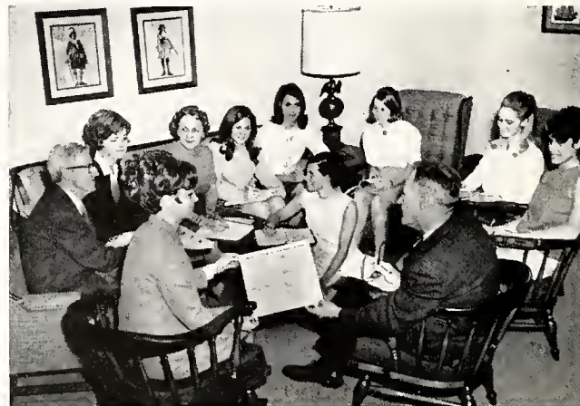
Student-Faculty Committees—Longwood's administrative policy provides students with an opportunity to share in the decision-making process with representation on all faculty and staff committees concerned with matters of primary interest to students. Shown above are members of the College's calendar committee which is responsible for scheduling major events during the year, including opening and closing of college, vacations, Founders Day, commencement, and summer school.