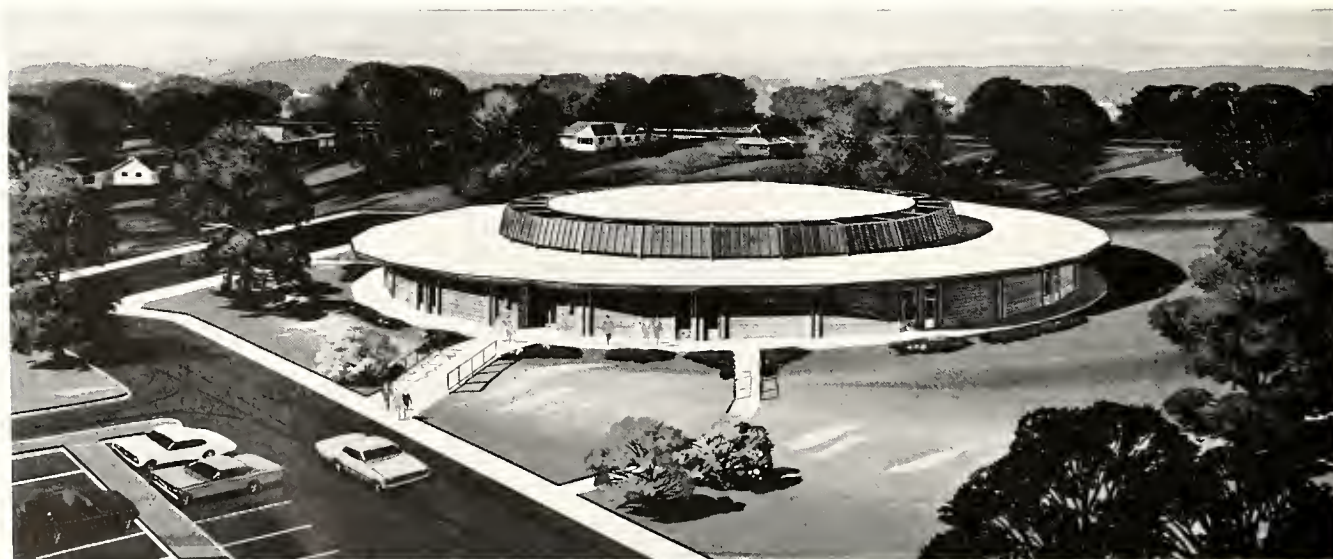
The architect's drawing of the John Peter Wynne Laboratory School—due to open in September 1970.