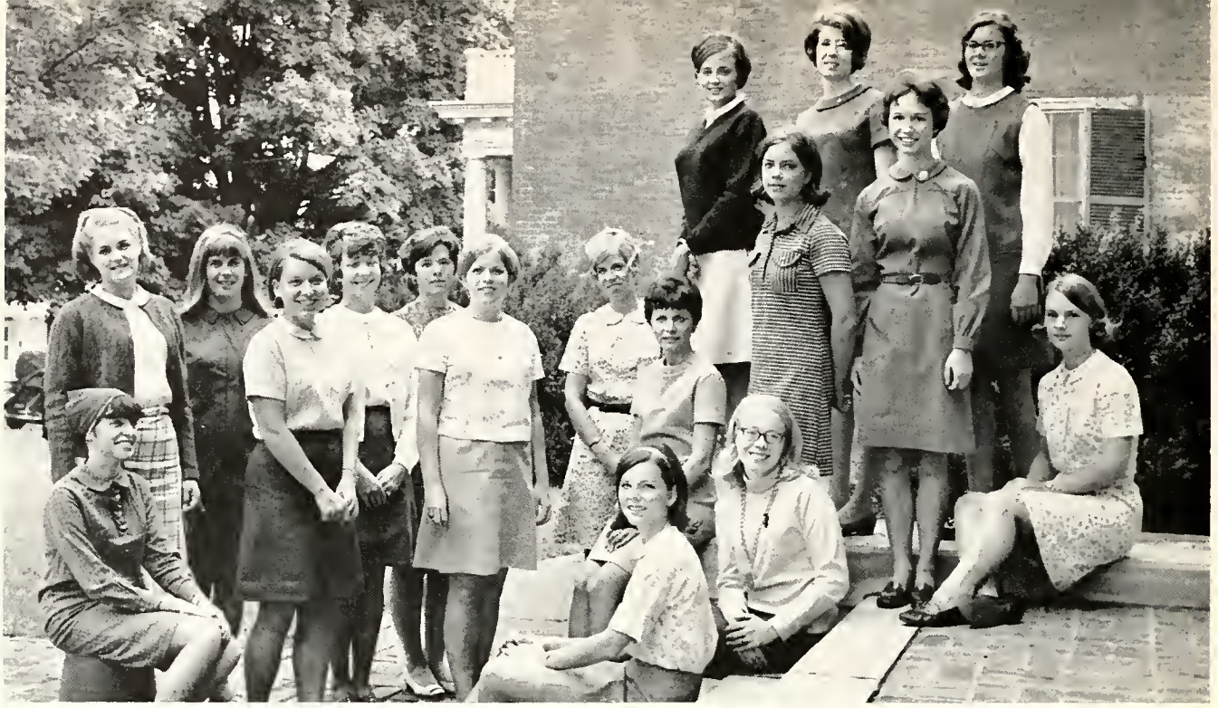
Freshman granddaughters welcomed on campus and join in projects with upperclass granddaughters.