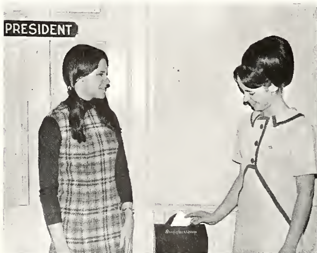
Students use suggestion box to receive prompt answers to questions through the president's office.

Another effective, albeit time worn, communicative device is that of the suggestion box. The use of such a box permits students to receive almost immediate answers to questions which arise at intervals between press conferences. Locating the box at the president's office enables questions to be channeled from that office to the proper administrative official. Student's frequently are not aware of the proper person to whom an inquiry should be addressed. All signed suggestions should be answered, frequently