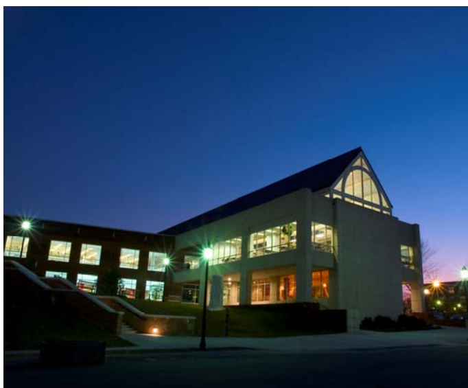
The Janet D. Greenwood Library