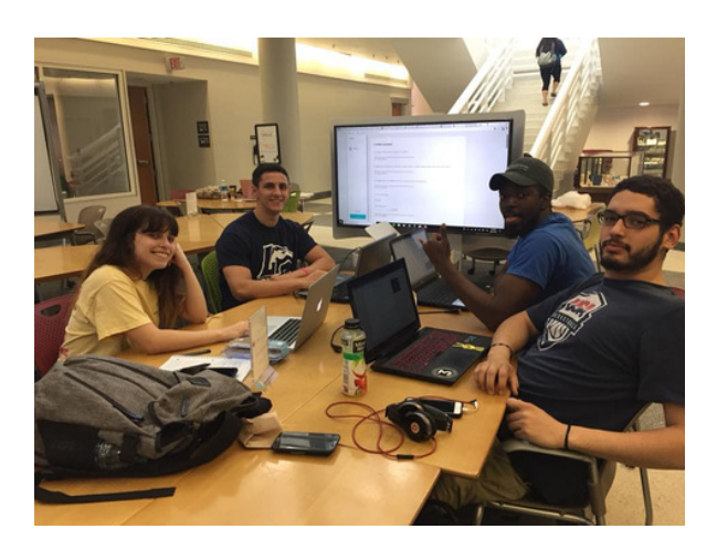
Students use the new media:scapes

The atrium has been painted, now displaying a bold stripe of Longwood blue, and half of the atrium has been carpeted to help with echoing in the large space. The taskforce is excited to continue its mission to create better spaces throughout the library.