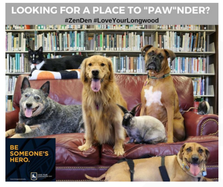
A library ad for Love Your Longwood Day.

In conjunction with the annual Day of Giving event, the Library led a successful campaign to raise funds to create a Zen Den, a pod of comfortable furniture in the Group Study area on the 2nd floor. Thanks to the generosity of many donors, the Zen Den will be installed for students in Fall 2018.