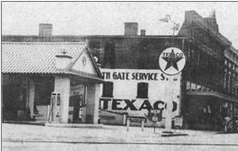
Corner of North Main Street and Depot Street