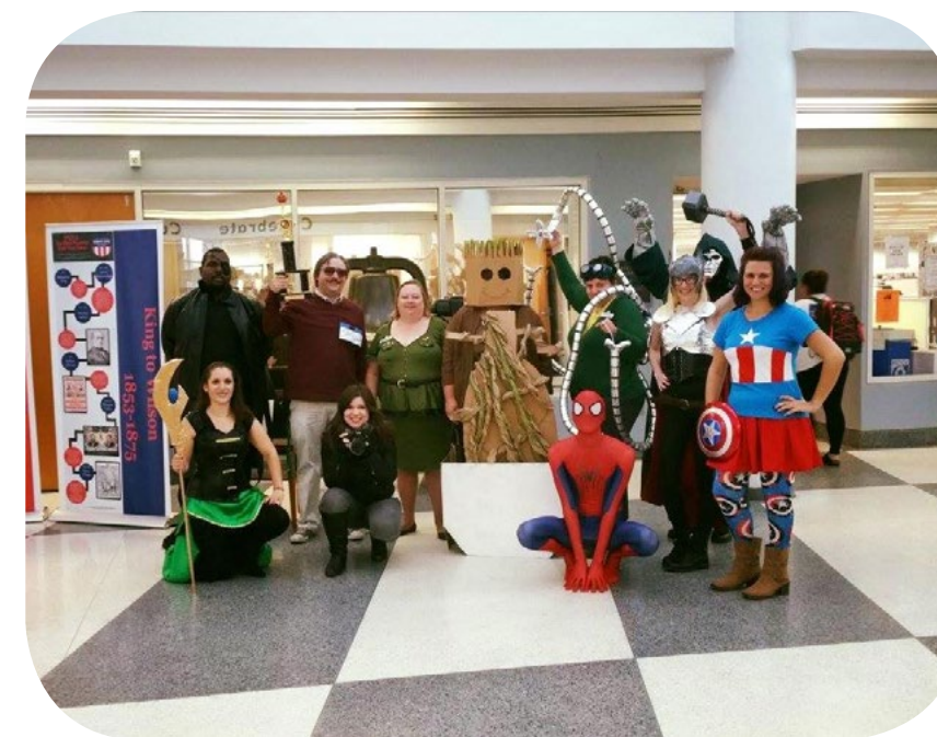
1st Place in the Staff Advisory Committee's Costume Contest