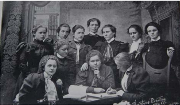
The Board of Editors for the premiere issue of the student yearbook that was originally titled The Normal Light .

You are invited to step back in time through the pages of Longwood's yearbooks. When you visit the Greenwood Library, stop by the Circulation/Reserve Desk and ask about viewing the yearbooks. In the meantime, please enjoy some of our favorite yearbook photos!