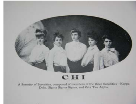
CHI, which is still in existence today, was founded in 1900. This photo from the 1903 yearbook features the members of this "Sorority of Sororities."