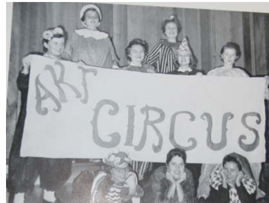
In 1927, the Joan Circle of Alpha Delta Rho organized the first Circus. In 1966, the fall event evolved into what is now known as Oktoberfest. These 1959 yearbook pictures feature some of the major players in the event.