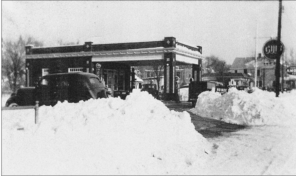
East Third Street, Farmville