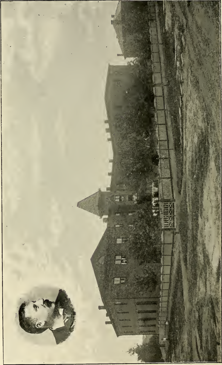
STATE FEMALE NORMAL SCHOOL, FARMVILLE, VA.